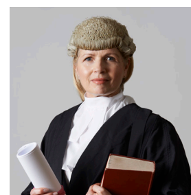
Upper class jobs