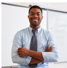
Middle class jobs